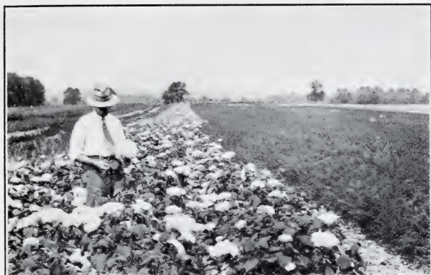
Hydrangea Arborescens Grandiflora , 1½ to 2 ft.